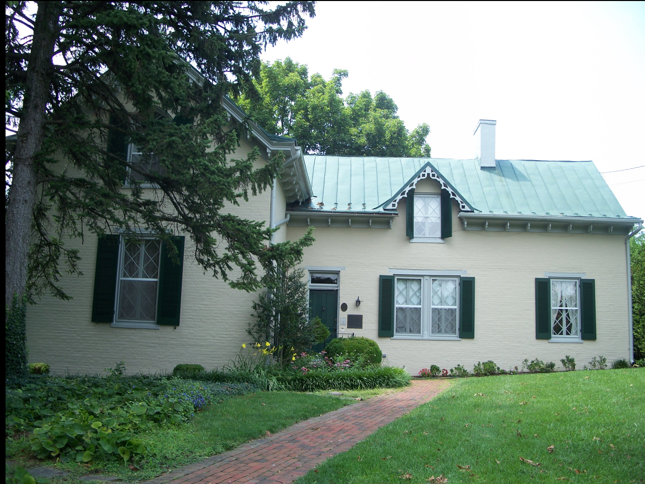
Jackson's Headquarters in Winchester Virginia